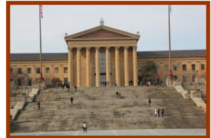
The steps leading to the Philadelphia Art Museum. A photograph of the group of survivors is not shown in order to protect their identities.

Every month for the past two years, the volunteers and residents of Dawn’s Place—a home where survivors can recover, regain dignity and build skills for a positive future in freedom—gather for an activity. While creating quilts, making bead bracelets, sharing international foods, or visiting cultural attractions, volunteers help international survivors practice English and learn American customs, and help all survivors learn to develop healthy relationships. In the past two years, Rotarians of District 7450 have also helped Dawn’s Place with books, furniture, and public transportation passes to get residents to medical appointments, shops, classes and new jobs.