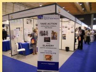
RAG booth at the Lisbon Convention 2013

Editor: Mark Little – Rotary Club of Norwich St Edmund, England