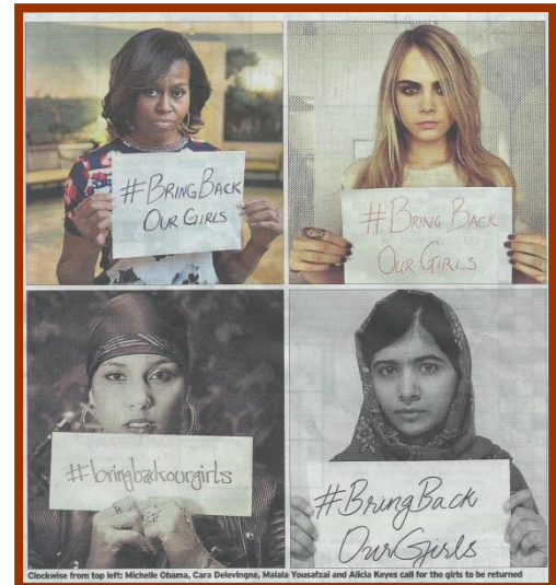
Clockwise from top left: Michelle Obama, Cara Delevingne, Malala Yousafzai and Alicia Keys call for the girls to be returned

If we Rotarians can achieve the impossible by almost obliterating polio from the face of the globe, we can surely make a significant contribution to the eradication of slavery.