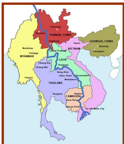
Map of the greater Mekong Sub-Region

NB: For more information about the Mekong Club see Page 5