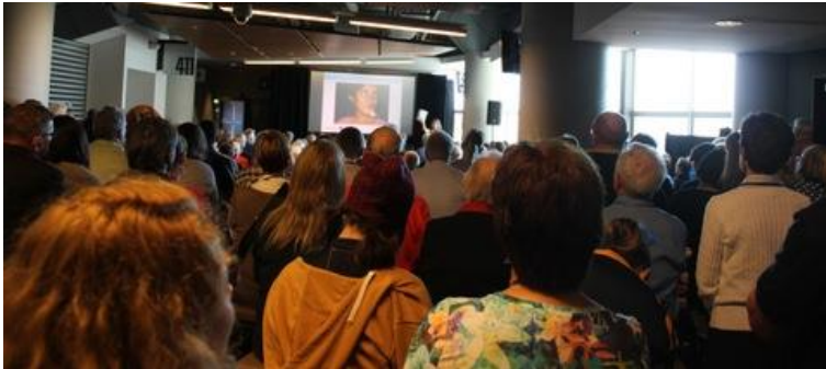
Breakout Session – 3 June 2014 “Rotarians Combating Child Slavery”

Upon reflection, the photography adventure capturing the VIVID lights was like my experience at the Rotary International Convention, also a first. I found vibrancy, color and warmth.