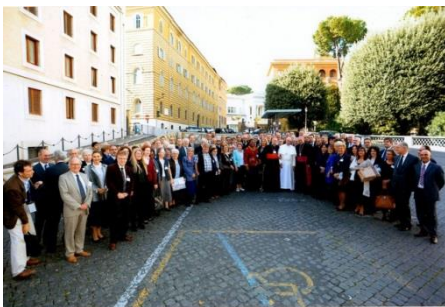
The delegates with Pope Francis after the Vatican Conference.

On November 2-3, 2013 I was honoured to represent the Rotarian Action Group Against Child Slavery as an Observer during the Working Group on Trafficking in Human Beings: Modern Slavery , organized by the Pontifical Academies of Sciences and Social Sciences at the Vatican City.